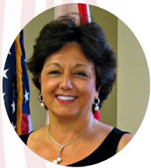
Kathleen Passidomo Florida State Senate