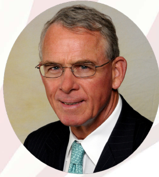
Francis Rooney U.S. Congressman Dist. 19