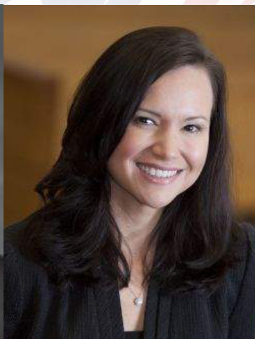
Former Judge Ashley Moody